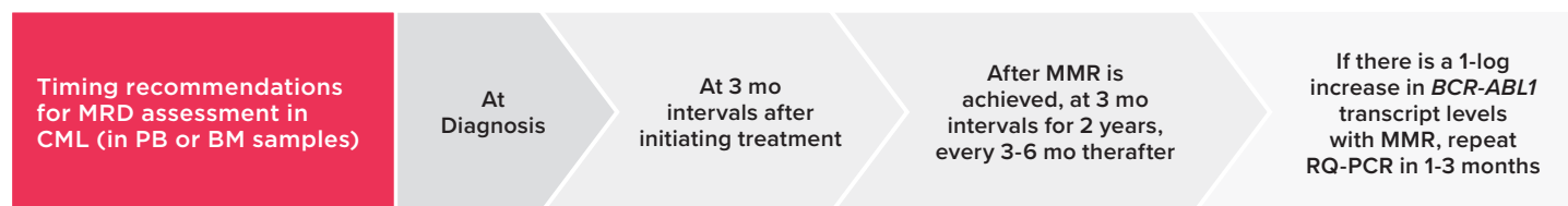
Table 5. When to assess MRD in CML 40

MRD monitoring in CML can be done on PB or BM samples. NCCN Guidelines, available here , recommend the timing outlined in Table 5 40 .